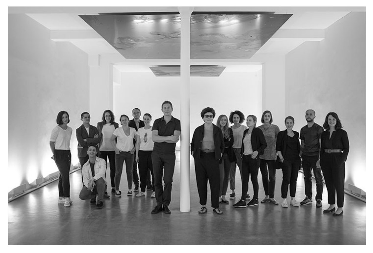
Gallery team, 2016.

On the occasion of the 40th anniversary, renowned Parisian gallery <u>Chantal Crousel</u> presents the publication Swear That You'll Play , looking back at the long history of the gallery. Published by Is-Land Édition and designed by Dune Lunel studio, the publication offers seven hundred pages and goes through a period of nearly four decades.