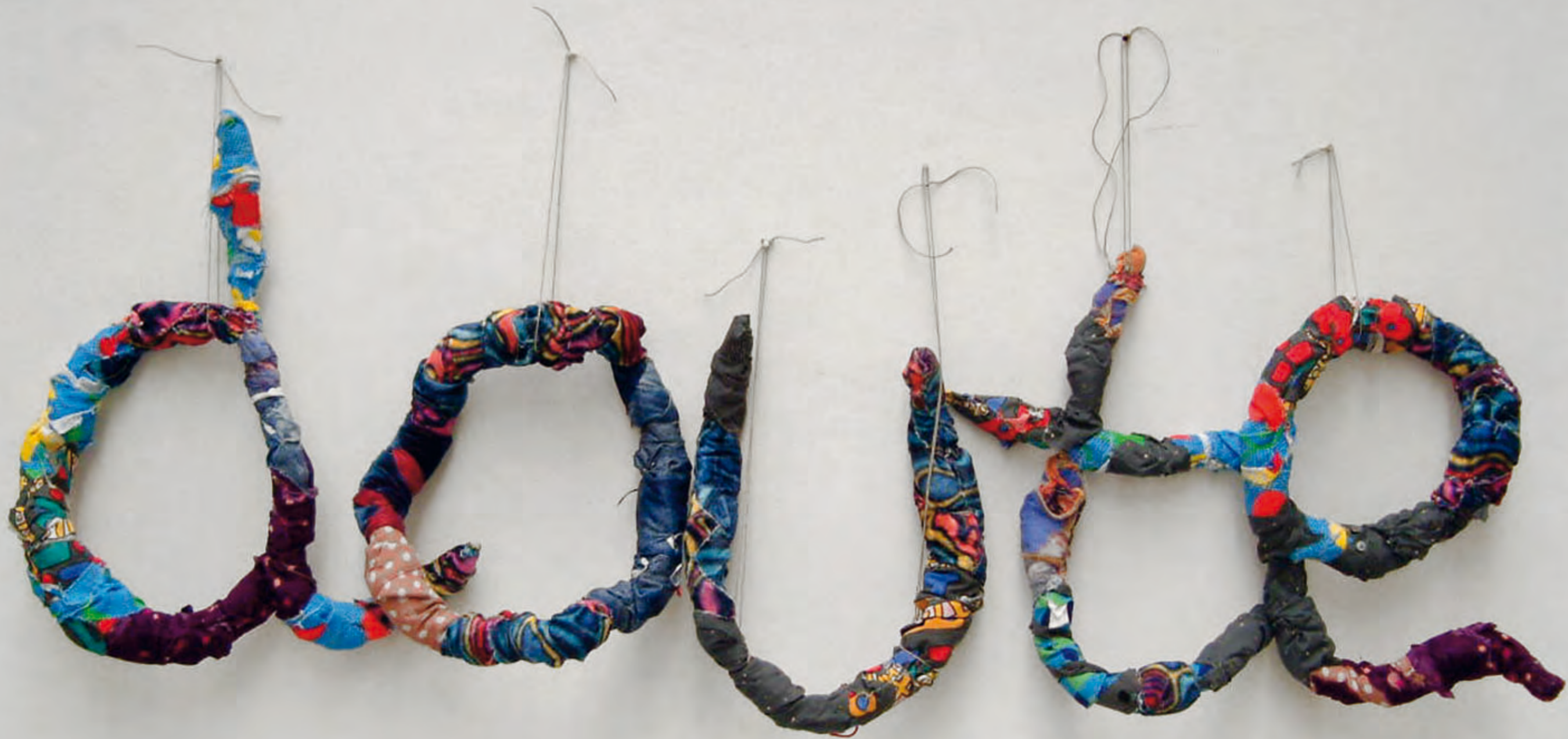
Studio photograph, 2006