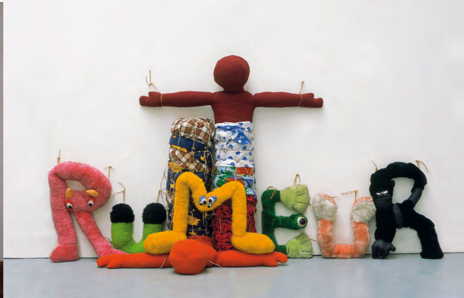
Rumor , 2000-2003 100 x 185 x 43 cm Fabric, stuffed toys, and string Private collection