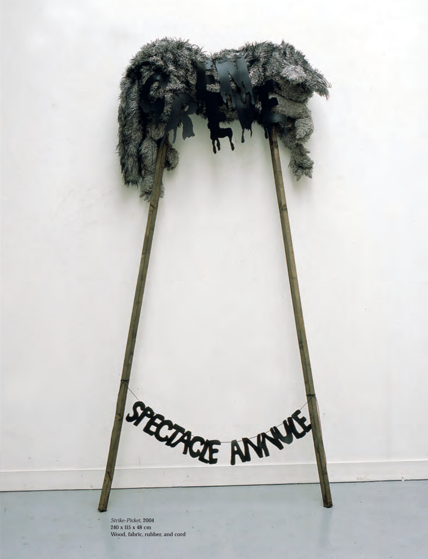
Strike-Picket , 2004 240 x 115 x 48 cm Wood, fabric, rubber, and cord