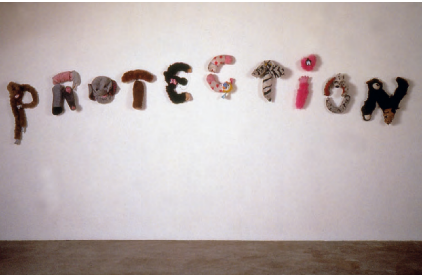
Protection , 1998 100 x 400 cm Stuffed toys, rope, and string Private collection