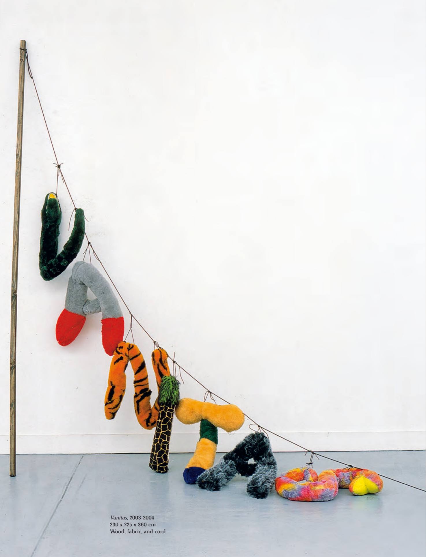
Vanitas , 2003-2004 230 x 225 x 360 cm Wood, fabric, and cord