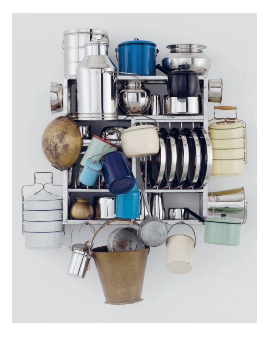
Subodh Gupta, The Family Nest, 2012.